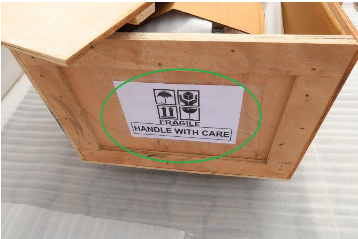
Fig. 7: Packaging labelling with a pictogram