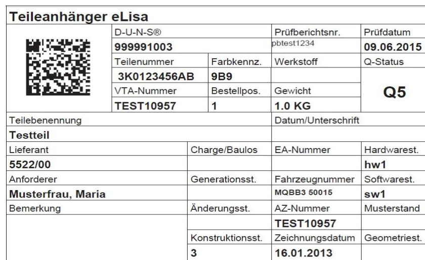
Fig. 3: Prototype label

https://iso.wob.vw.vwg/one-kbp/content/cs/kbp_private/information_1/divisions/research_development/prototype_parts/prototype_parts.jsp