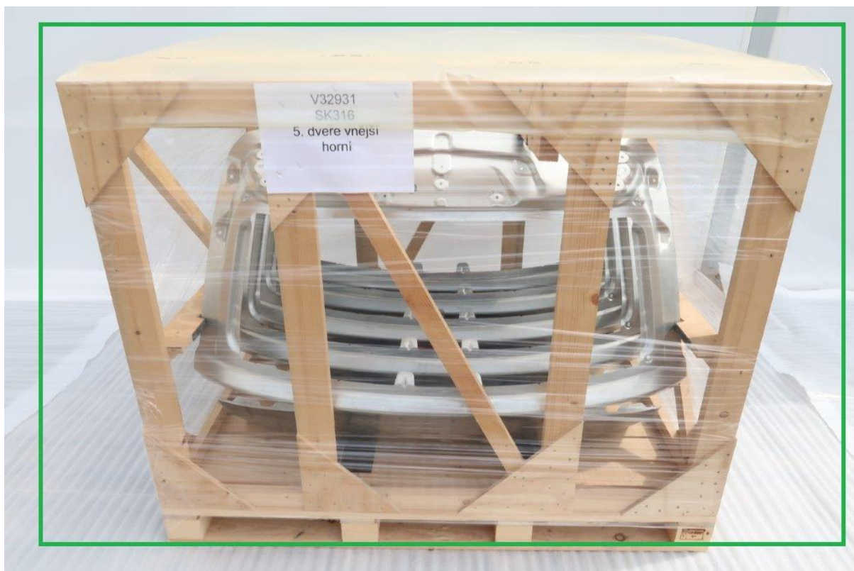
Fig. 2: The packaging is secured with a packaging foil against dirt, moisture, etc.