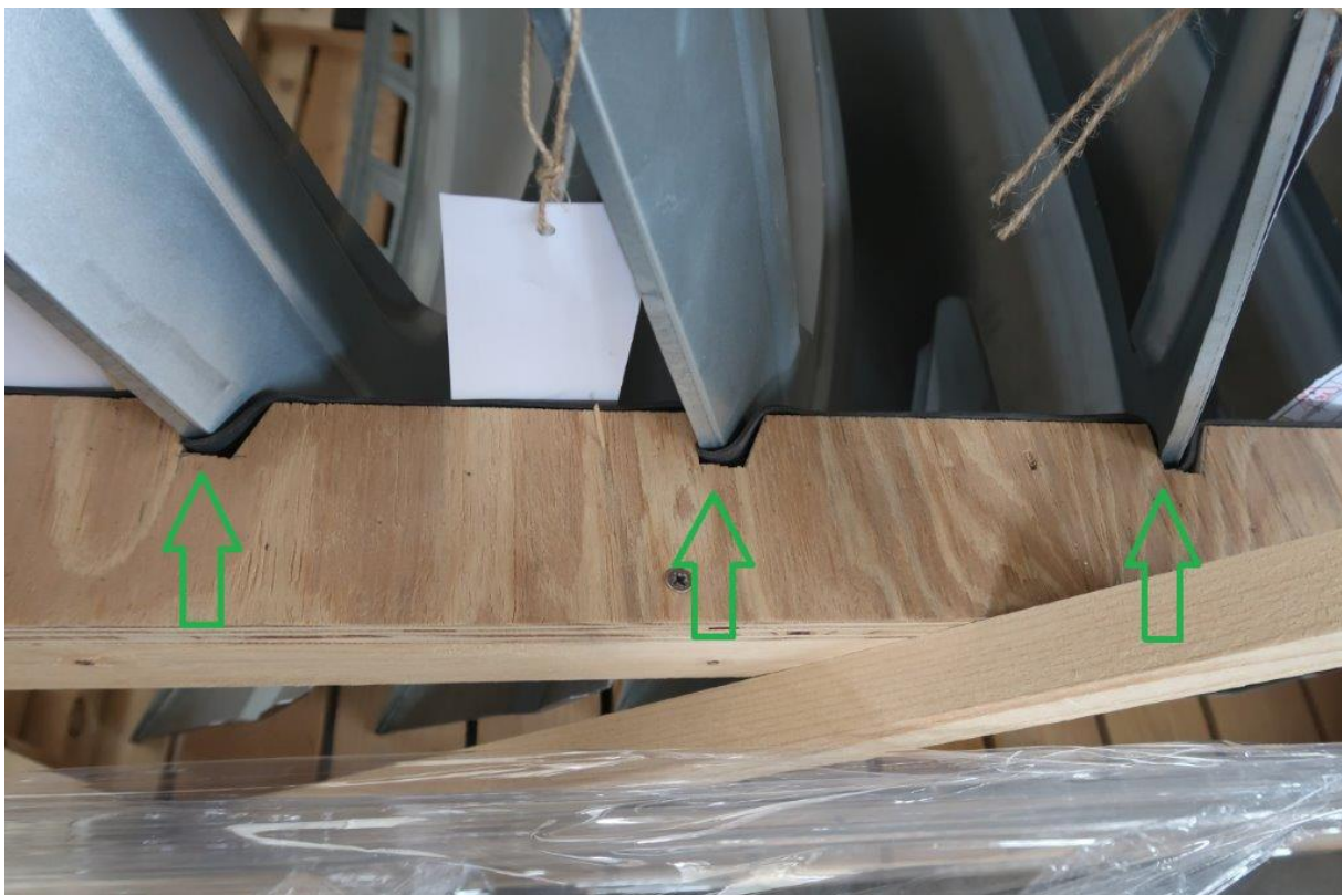
Fig. 4: Fixing of parts to protect against damage or free movement

3: Method of packaging and lining before damage to individual parts.