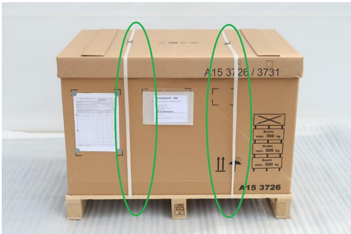
Fig. 1 The pallet and packaging are secured by a strapping tape against free movement during handling.