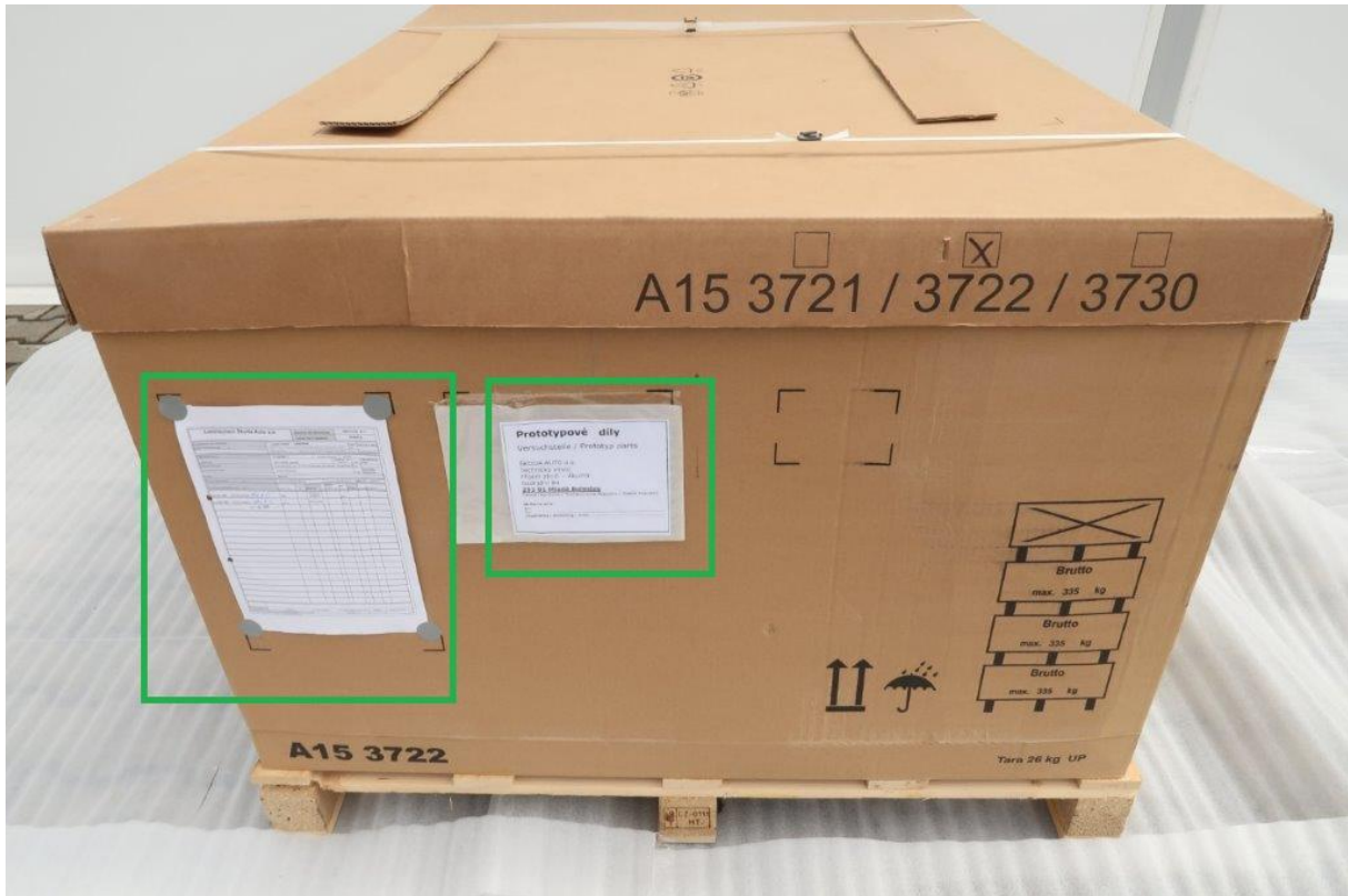
Fig. 6: Delivery note with indication of delivery location for fast identification