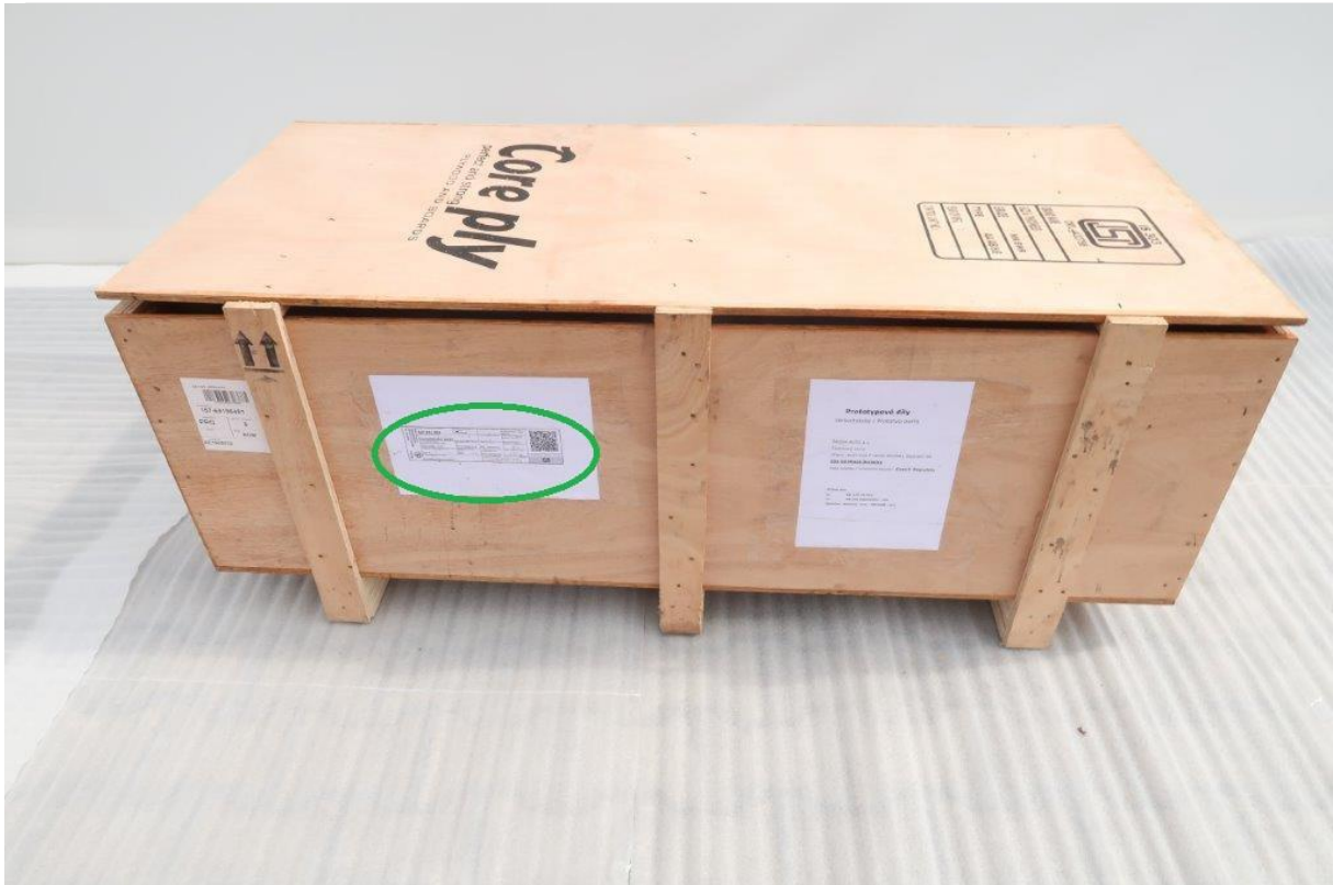
Fig. 5: Labelling of the packaging with a tag and an identification label